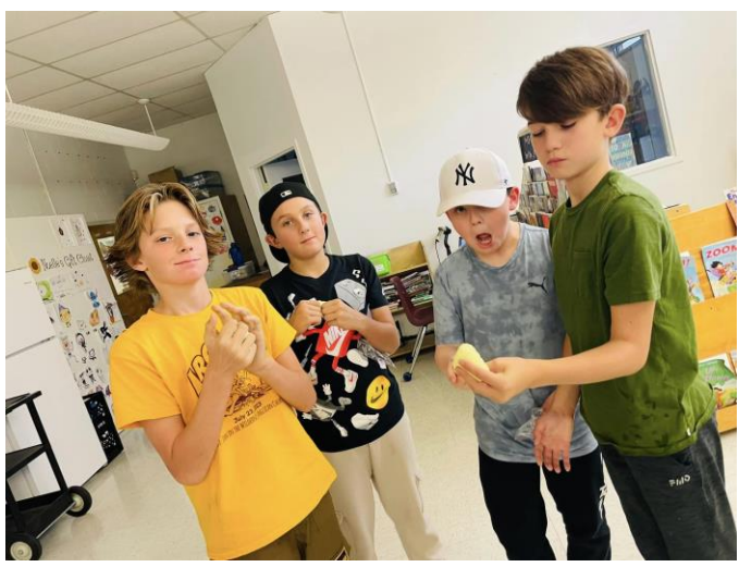
Slimy STEM Experiments!